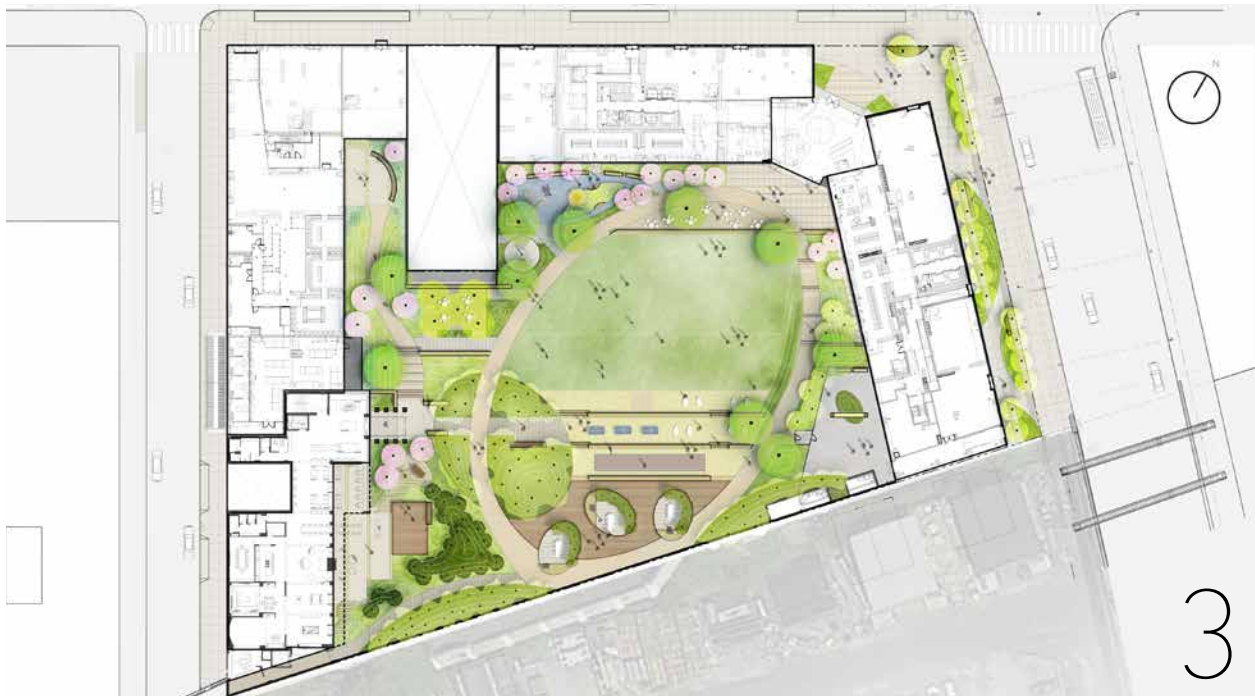
1 Commons Program Diagram 2 Plant Community Framework Diagram 3 Final Landscape Commons Design 4 Building and Amenity Commons