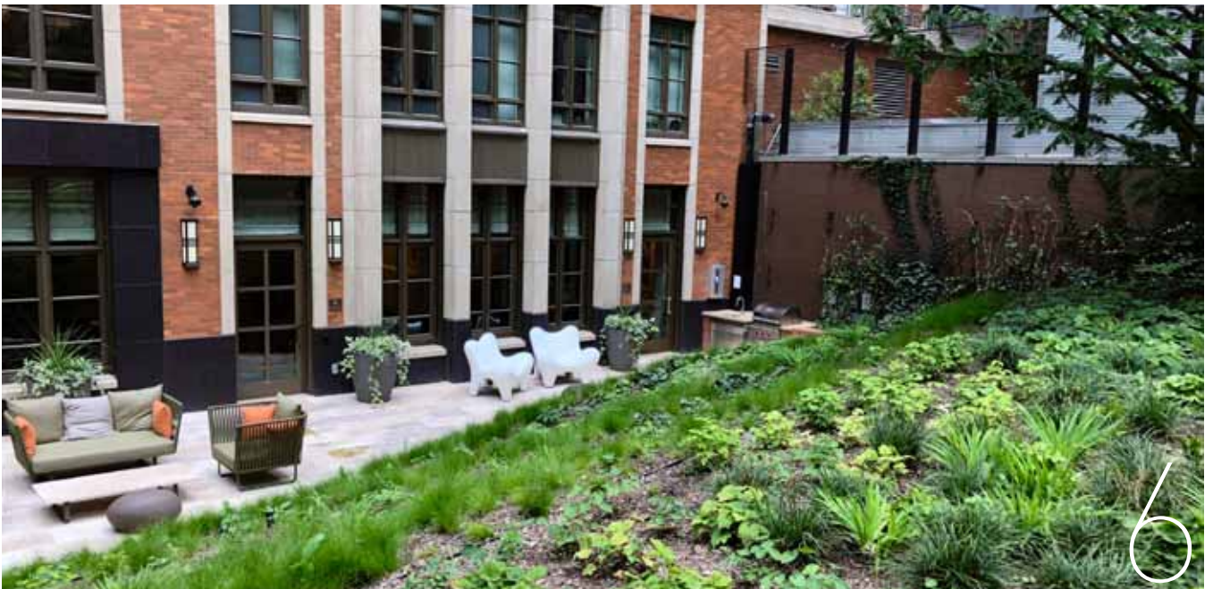
2. Garden court illustrative plan; 3. Geo-grid slope stabilizer; 4. Dawn Redwood installation; 5. Garden terraces under construction; 6. Early garden completion.