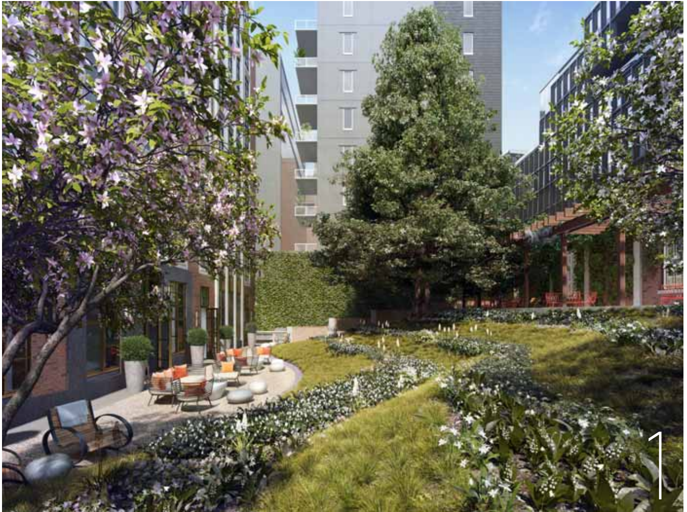
1. Garden court rendering