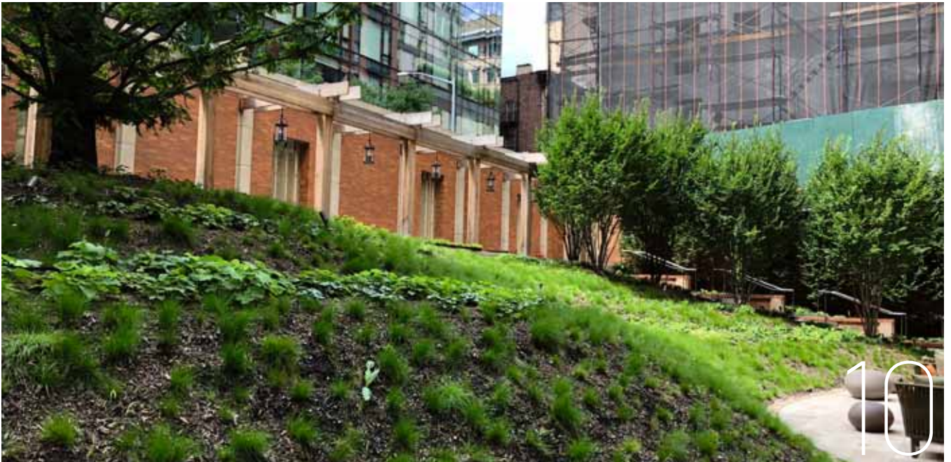
7. View from garden belvedere; 8. Belvedere dining terrace; 9. Granite steps to lounge terrace; 10. Bristle-leaved Sedge chevron slope (early).